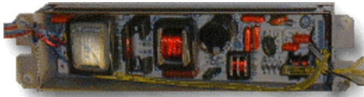
Figure 2. Typical Heater Cutout Fluorescent Ballast

Heater Cutout (Hybrid) Ballasts are similar to magnetic ballasts but include an electronic circuit that removes the voltage to the electrode heaters in rapid-start lamps once the lamps are operating. By eliminating the power consumption normally used to heat the electrodes, these ballasts consume about 20 percent less power than standard magnetic energy-efficient ballasts. Lumen output is reduced about 12 percent.