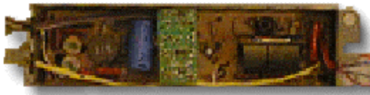
Figure 3. Typical Electronic Fluorescent Ballast

Heater Cutout (Hybrid) Ballasts are similar to magnetic ballasts but include an electronic circuit that removes the voltage to the electrode heaters in rapid-start lamps once the lamps are operating. By eliminating the power consumption normally used to heat the electrodes, these ballasts consume about 20 percent less power than standard magnetic energy-efficient ballasts. Lumen output is reduced about 12 percent.