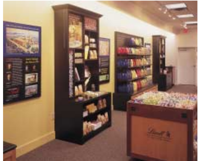
Lindt Chocolate Shop Albany, NY

Three 40 W fluorescent long twin tube lamps (FT40/835) in the parabolic troffers use one instant-start electronic ballast per luminaire (101 W). Soffits have simple one-lamp linear fluorescent striplights (F32T8/735) placed end-to-end, with one instant-start electronic ballast for every two striplights (58 W). Trackheads are lamped with halogen incandescent floods (50PAR30/NFL).